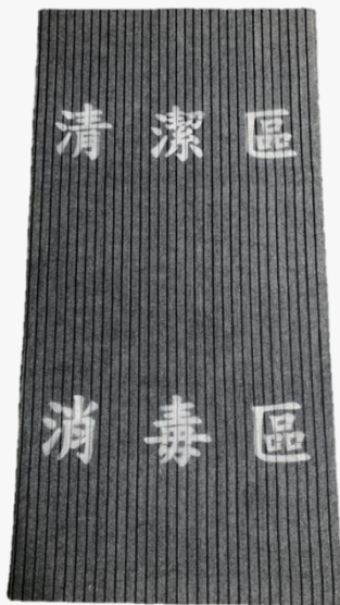
Disinfection blanket (Size: 1 x 2 m 、PVC material)